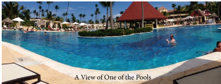
A View of One of the Pools