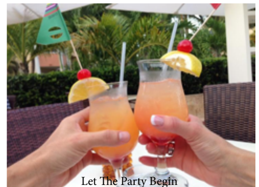
Let The Party Begin

**Airfare: The ski club is offering this trip as a land only package at this time. The intent is to offer a group airfare package for those wishing for the club to make those arrangements. I will support you either way whether you wish to book your own or to take advantage of the group airfare. Southwest is my preferred Airlines although I may check with others. I've talked to the Southwest Airlines group department and the agent suggested airfares for our May 2019 departure may not be available until October or early November. Relax. That's still about 6 months out from our travel date. For now, I'll make a list of names interested in the group airfare. The airfare price above is strictly an estimate although it is an actual airfare price for February and March 2019.