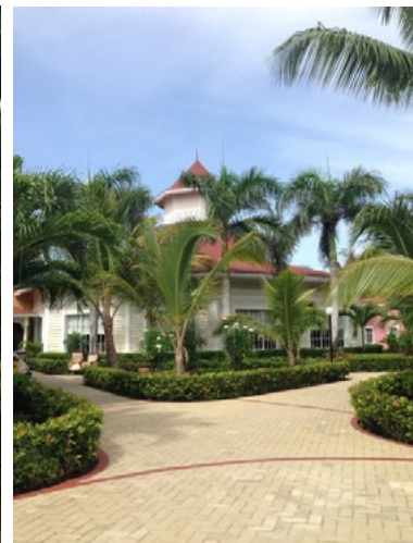
Two Views of the Grounds