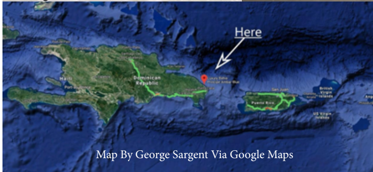
Map By George Sargent Via Google Maps

Join the Space City Ski and Adventure Club at one of the best beach adventures in the world. Travelers will be rewarded with your first Mamajuana* (customary and a must try) or a cocktail of your choice upon arrival at the Luxury Bahia Principe Ambar . Okay. That's a long name so I'll just call it the Ambar. The Bahia Principe is a mega resort including multiple locations catering to the whims of patrons from around the world. The Ambar is a secluded section for adults only yet Ambar patrons may visit other areas of the resort. TripAdvisor reviewers give the Ambar a 4.5 rating out of 5. I've been there and it is a nice place!