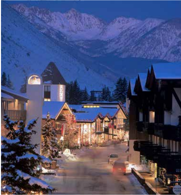
Vail Village

After so much planning, it is difficult to believe that ski season is already upon us.