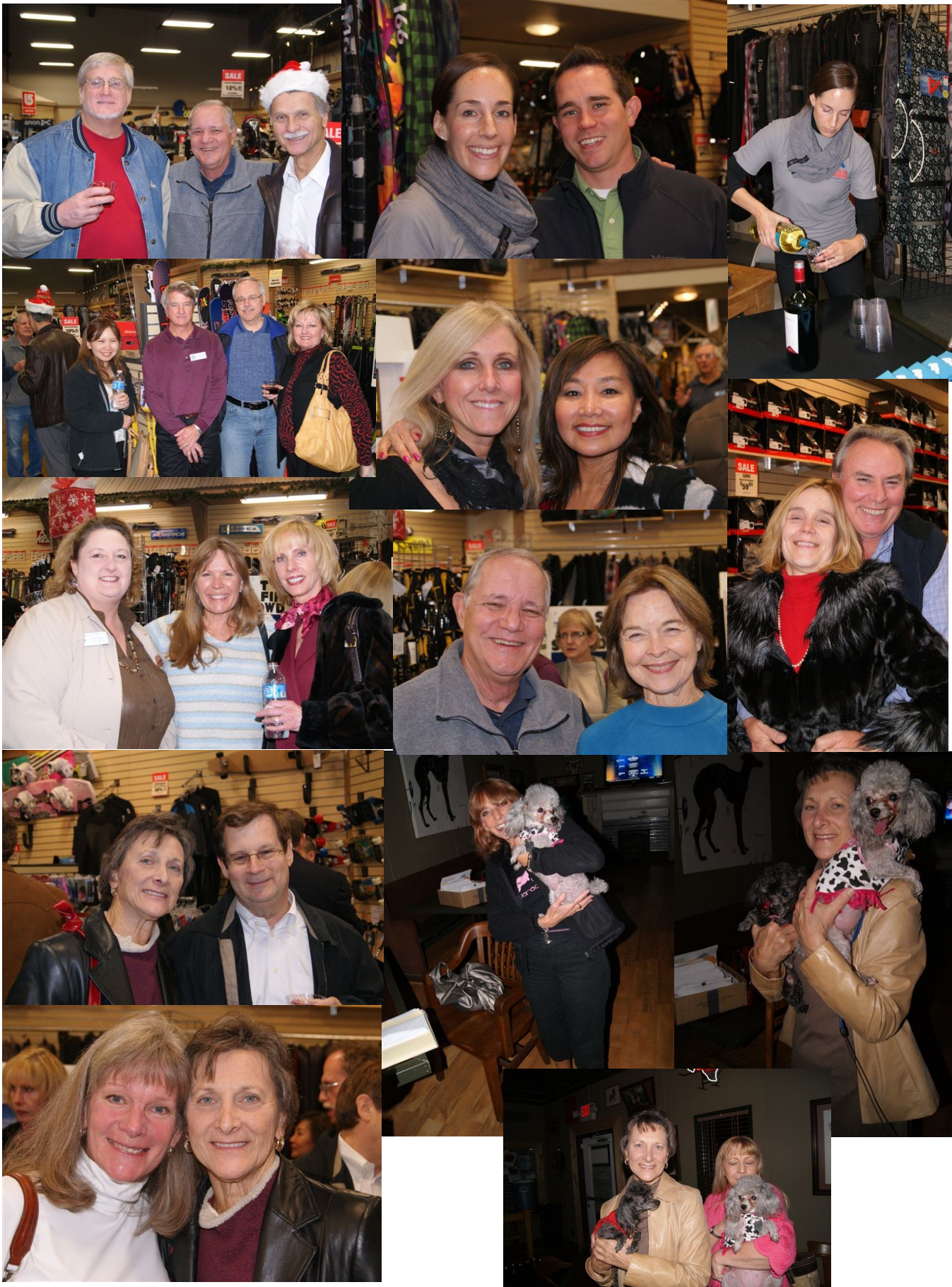
Happy Hour 11/17 Boneyard Dog Park & Drinkery And Sun&Ski Social 12/7