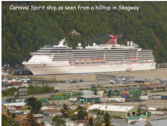
Carnival Spirit ship as seen from a hilltop in Skagway

tivities poolside, head to the spa, workout in the gym, enjoy the heated pool and hot tub, or tried their luck at the casino. Some stayed in their cabin during the day to relax, and most had a balcony view of the open seas. The second night was the Captain's cocktail party prior to dinner, and a formal dinner served, with the group wearing evening dresses and suits.