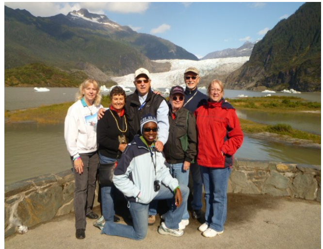
An amazing sight to see: the Mendenhall Glacier in Juneau