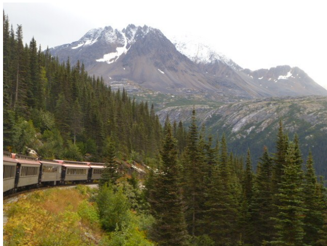
Breathtaking views aboard the White Pass & Yukon Railway Excursion. The railway was built in 1898 during the Klondike Gold Rush