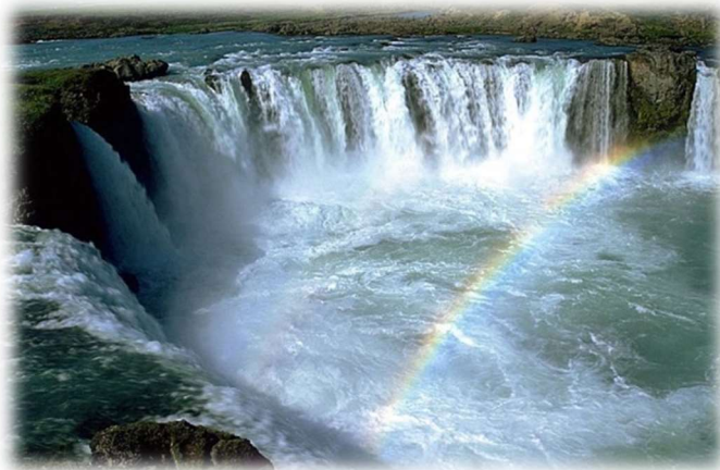
Gothafoss waterfall

We will explore Gothafoss, the waterfall of the Gods, and continue to Lake Myvatn, known for its rich bird life and extraordinary volcanic lava landscapes. You may wish to go on an optional whale watching excursion in the afternoon. Dinner is at the hotel.