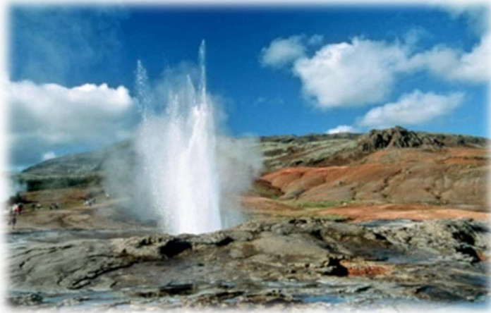
Strokkur Geyser

Over a scenic route, we reach Thingvellir National Park and UNESCO World Heritage Site. Stroll around the country's most sacred site, home of the oldest existing parliament in the world, the Alþingi. Next we explore the valley of Huakadalur that is home to the geyser Strokkur which erupts at about 5-7 minute intervals. Evening is at your leisure.