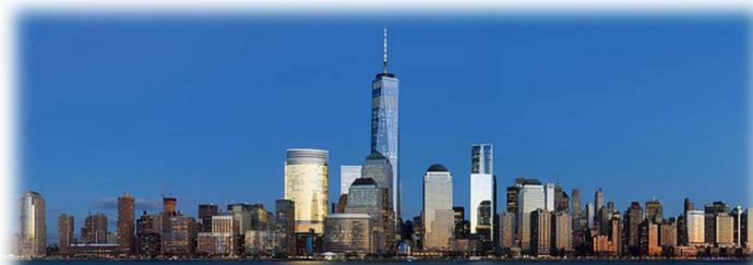
New York City

Explore The Big Apple with your friends. Visit Times Square, Metropolitan Museum of Modern Art, Broadway shows, Empire State Building, Statue of Liberty, Ellis Island, Central Park, One World Trade Center---and that barely scratches the surface! Check out what's playing on Broadway and make your reservations as soon as possible. The hotel selected will be within a few blocks from Times Square.