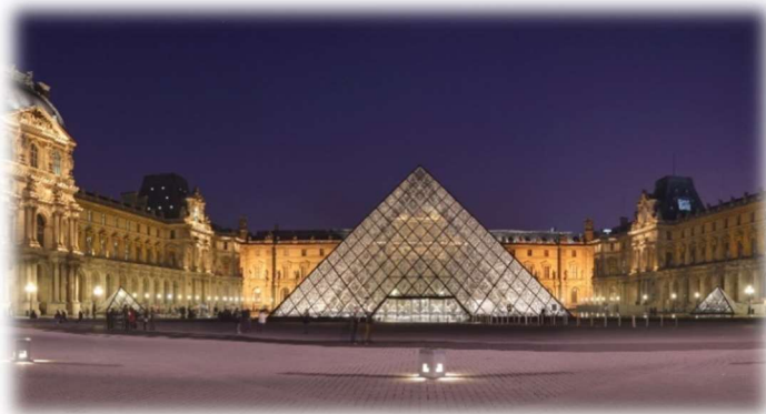
Courtvard of the Louvre Museum. with Pvramid Author: Alvesgabar