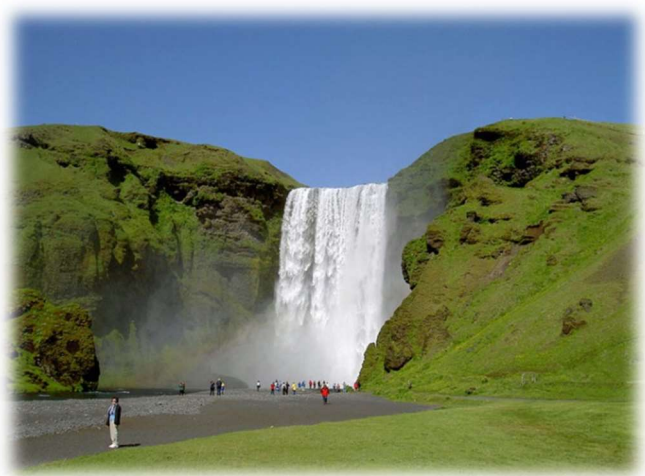
Skogafoss waterfall

Our route passes through some of the prettiest countryside in Iceland with fields, farms and villages toward the glaciers in south Iceland. The impressive Skogafoss waterfall is more than 197 feet high. After a lunch break, we reach the volcanic black sandy beach of Reynisfjara that is famous for its bird species, especially puffins. The Farewell TSC dinner will be held at the hotel in Reykjavik.