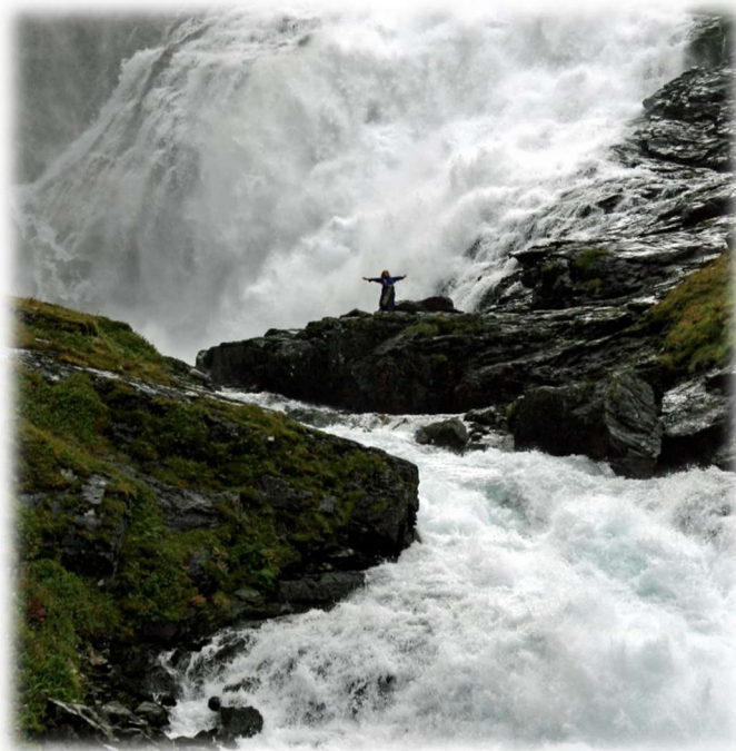
Kjosfossen waterfall

An optional tour via a spectacular train which will stop at Kjosfossen, a waterfall with a 738 ft. drop is available. We'll continue on a boat to view the amazing fjords and picturesque villages. Our return to Bergen is via a tour bus which will climb through the hairpin turns on Stalheimskleiva.