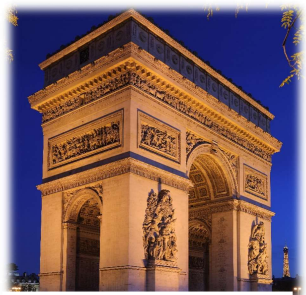
Author: Benh LIEU SONG

4-star hotel near the Montparnasse train station. The hotel is located in an area with good access to public transportation. We will leave Paris on January 22 and travel by train to Geneva where we will meet the Paradiski main trip participants.