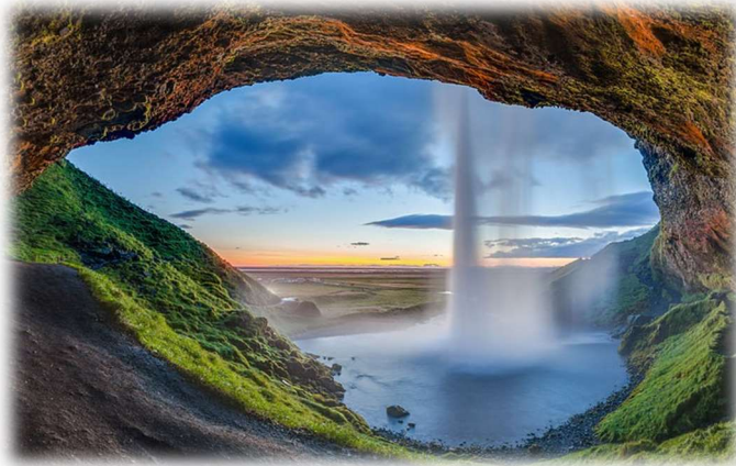
Iceland Waterfall

Our route passes through some of the prettiest countryside in Iceland with fields, farms and villages toward the glaciers in south Iceland. The impressive Skogafoss waterfall is more than 197 feet high. After a lunch break, we reach the volcanic black sandy beach of Reynisfjara that is famous for its bird species, especially puffins. The Farewell TSC dinner will be held at the hotel in Reykjavik.