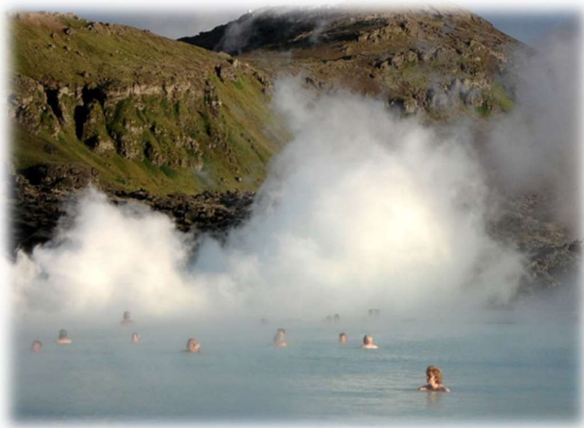
Blue Lagoon

Departing Houston August 23 rd on Delta, we arrive in Iceland the morning of August 24 th . We'll start the day with breakfast in Keflavik. Our bus will then drive us to the Blue Lagoon, one of Iceland's most popular attractions. We'll have 1-1/2 hours to enjoy a refreshing bath or a swim in the inviting, rejuvenating and warm mineral-rich water. Be sure and pack a swimsuit in your carry on! Tonight is our Welcome TSC dinner at a local restaurant in the city center. We are staying in the First Aldi Hotel located on the main boulevard.