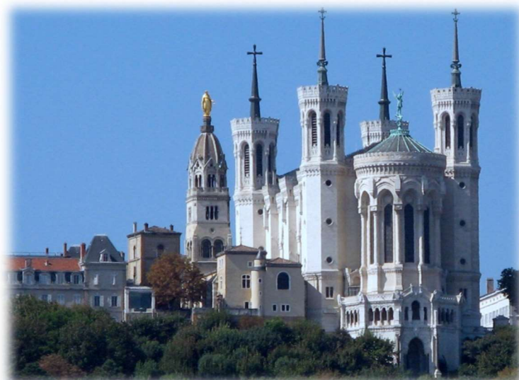
Basilique de Fourviere (Lyon) vue de la Saone

It will be a fun-filled week for both skiers and non-skiers. Spectacular scenery of the French Alps, miles of wide open runs, great après-ski, plenty of activities, day tours and culture at no extra charge at a beautiful all-inclusive resort. What more could you want? Sign up soon!